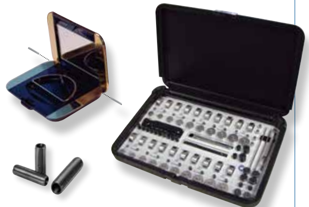
SPIROL® Series 550 Coiled Pins